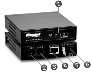
SP3501A Series VDSL CO/CPE Modem